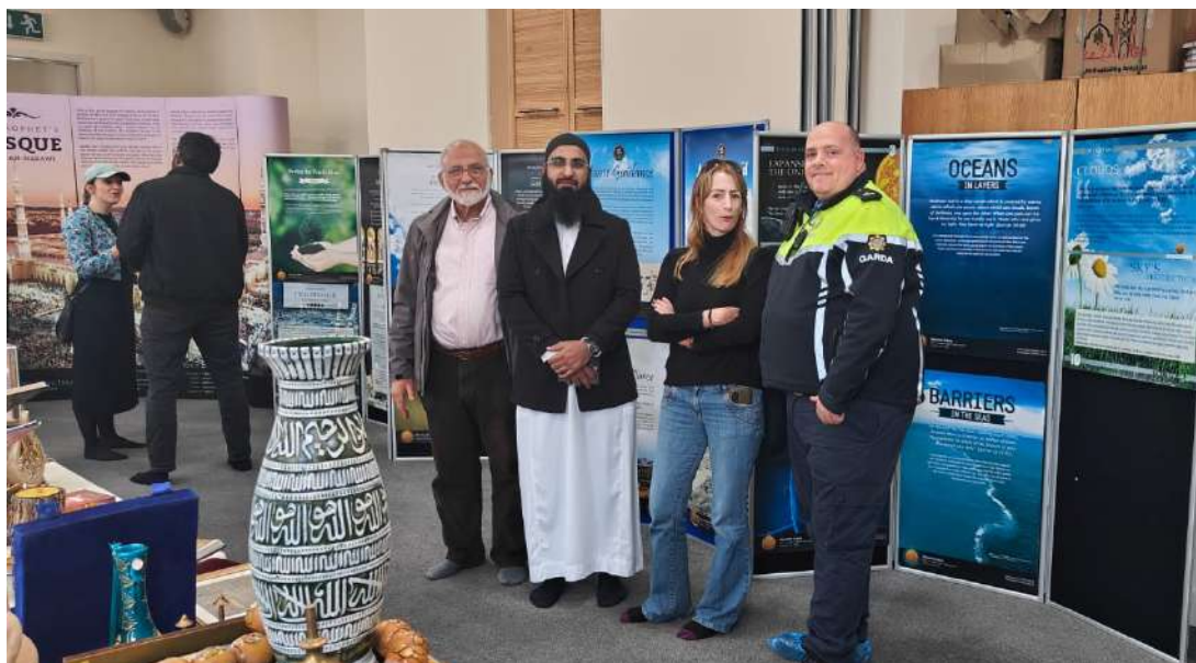
Mosque open Day May 2024

There were around 90 people who visited the Mosque on the day.