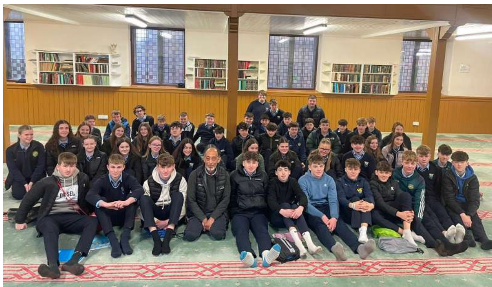
Secondary school students visiting the Mosque.

During the period from May 2024 to April 2025, fifteen (15) school and college visits were carried out. There were visits from primary and secondary schools in addition to colleges and outreach initiatives. Attendees experienced guided tours of the Mosque, introductory talks on Islam and discussions about life in Ireland for Muslims.