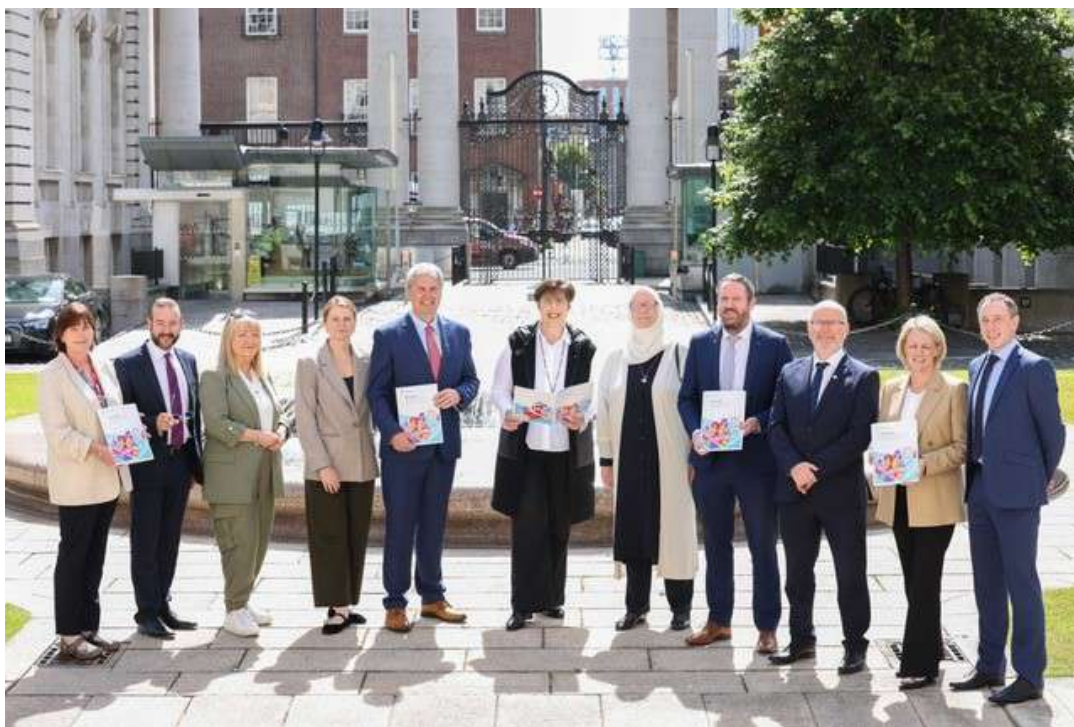
Launch of Anti-Bullying Action Plan with Minister for Education June 2024

consult and advise on dissemination and communication of information to schools and inform how supports can be used to best effect.