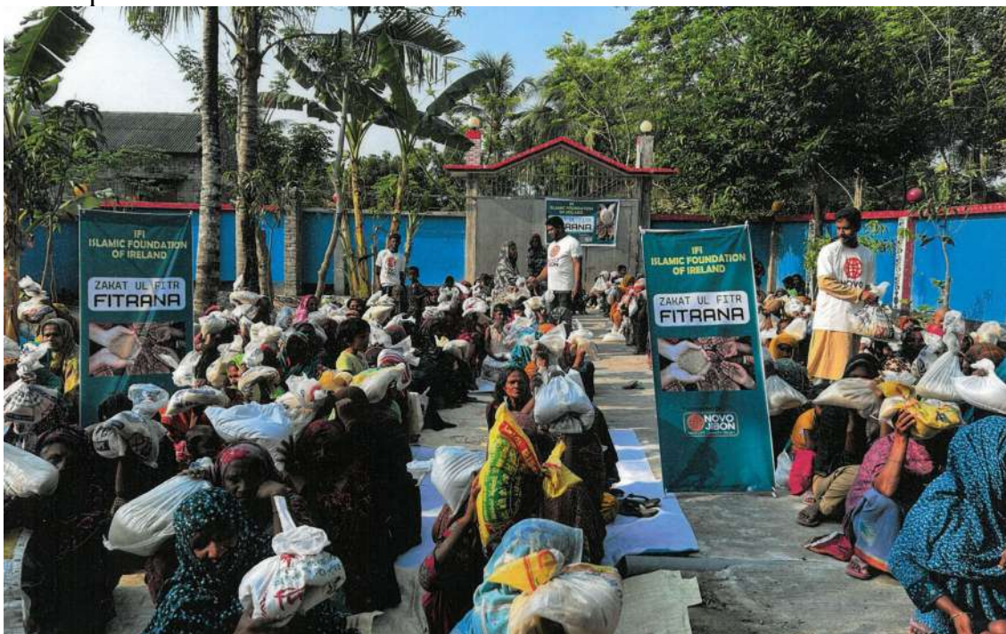
Zakat al-Fitr distribution

Zakat al-Fitr in the year 2025 (1446 H) amounted to €13,859.00. It was distributed abroad to needy Muslims in Somalia, Morocco, Yemen, Rohingya, Africa, Palestine and other places.