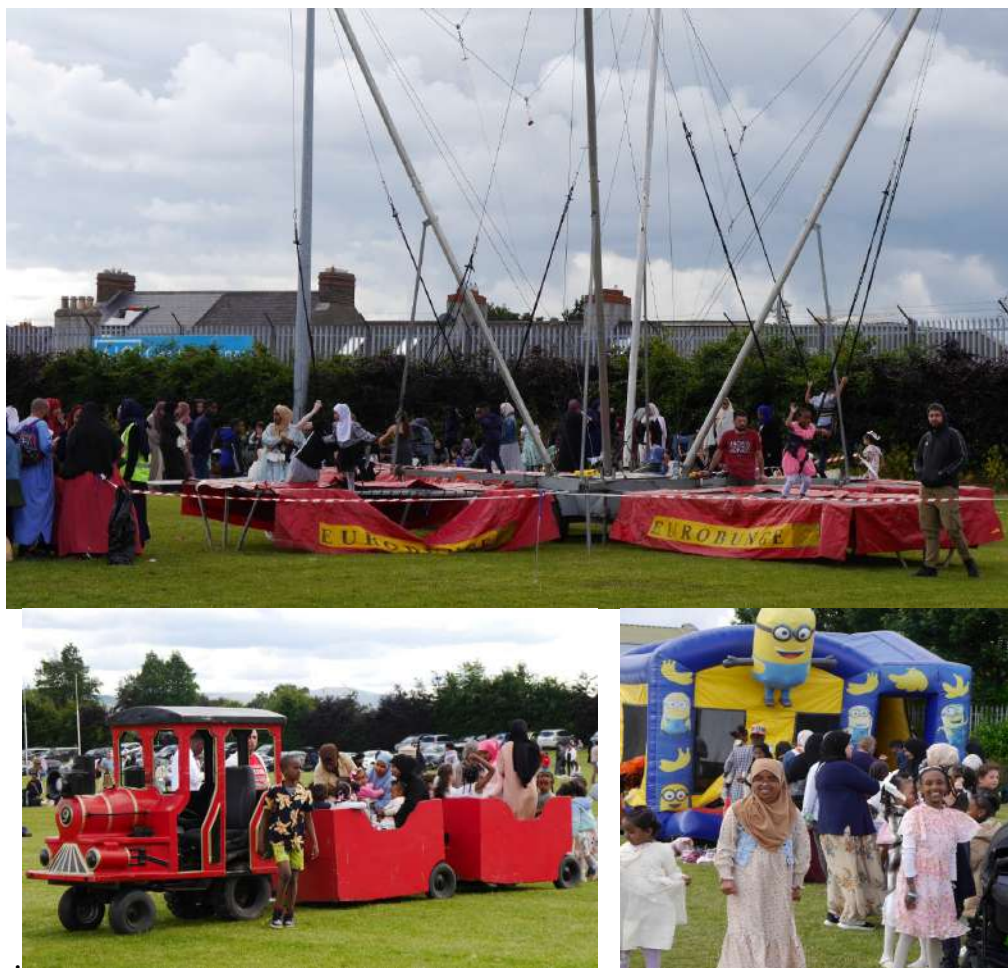
Eid al-Adha 2024

As part of the Eid al-Adha celebrations, family day was organised by the Social and Outreach Committee on the Eid day (16/05/2024) from 12 to 5 p.m. at the Dolphin Park, Templeogue Synge Street GAA Club, Crumlin Road, Dublin 12.