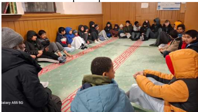
Morning Dhikr after Fajr prayer