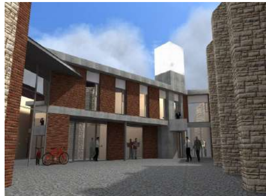
Proposed top floor building

So far €498,565 has been raised. Forty six thousand six hundred and twenty six (€46626) euro has been raised during the year. It is hoped that the construction work would start when we reach a certain amount of the projected budget.