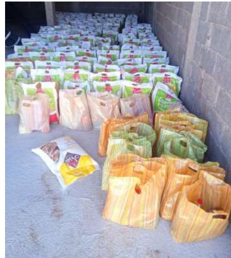
Zakat al-Fitr money received by IFI used to buy food and distribute it to the poor in some Muslim countries.