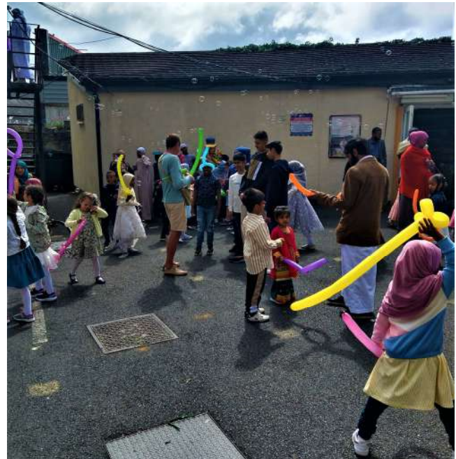
Eid al-Adha 2023