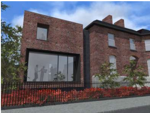
Proposed two storeys building on the left

Efforts continued to fundraise for the project. Collections after Friday prayers were made on monthly basis. Direct debt forms were distributed to those who preferred to make monthly donations. Currently there are fifteen (18) brothers and sisters who make monthly contributions to the extension project. The monthly paid monies range between €5 to €100 with an average total of €328.50 per month.