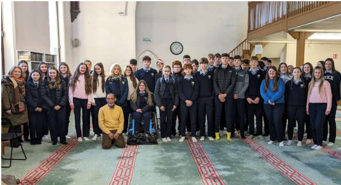
Secondary school students visiting the Mosque.

During the period from May 2023 to April 2024, eleven school visits were carried out. There were visits from primary and secondary schools in addition to colleges and outreach initiatives. During the year there have been casual visits to the mosque. Attendees experienced guided tours of the Mosque, introductory talks on Islam and discussions about life in Ireland for Muslims.