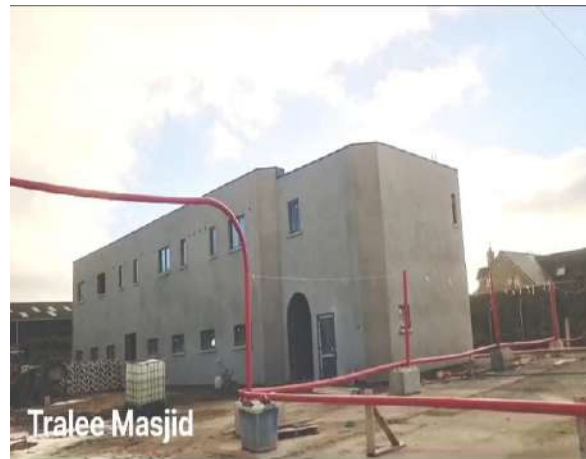
Tralee Masjid March 2024