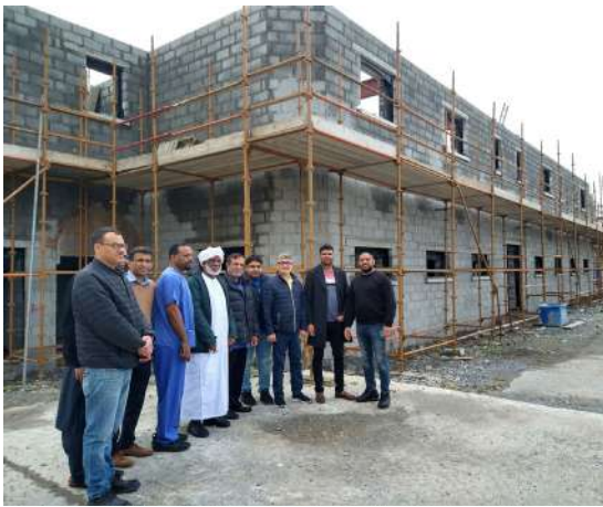
Tralee Masjid construction Sep. 2023