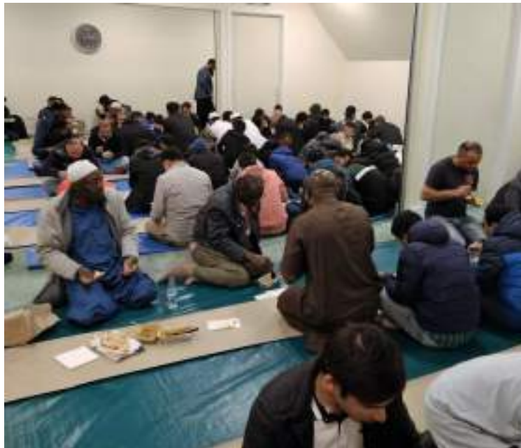
Iftar meal at Dublin Mosque 2022

the Masjid. On the last two weekends (Fri – Sun) of the month, Iftar meals were provided by Al-Khair Restaurant – for a total of six days.