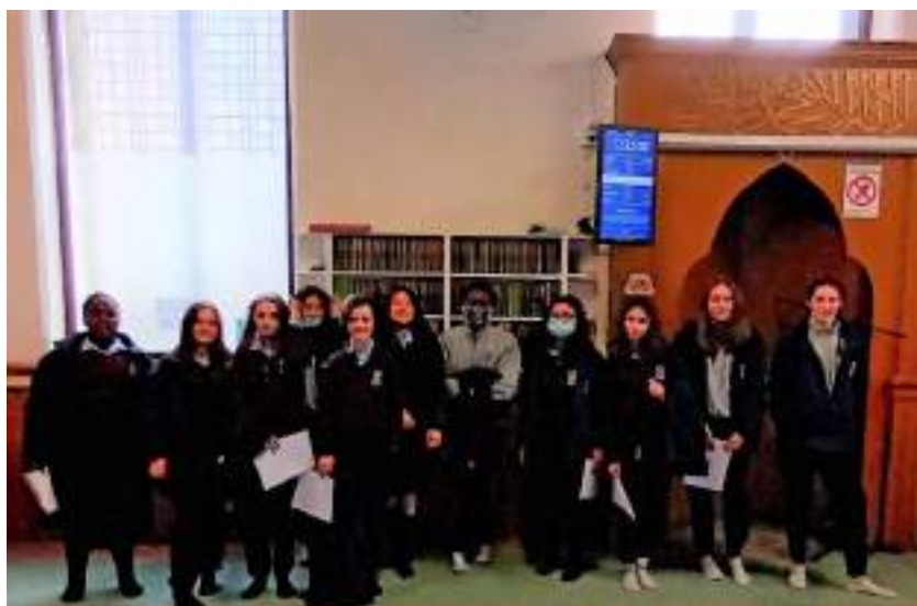
Secondary school students visiting the Mosque

The Islamic Foundation of Ireland has welcomed diverse groups to the mosque and provided workshops and talks on Islam and Muslims. We have had visitors from youth services, third level students studying theology and media. Attendees experienced guided tours of the Mosque, introductory talks on Islam and discussions about life in Ireland for Muslims.