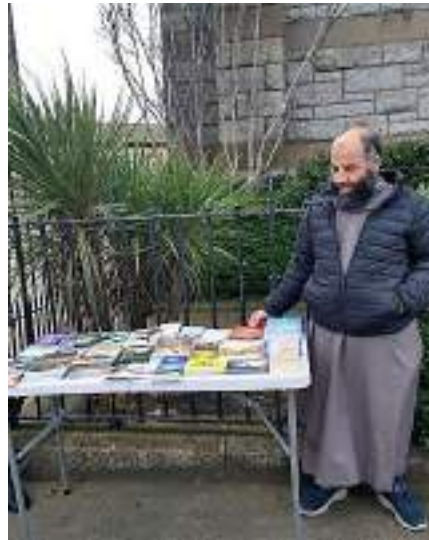
Dawah table outside Dublin Mosque