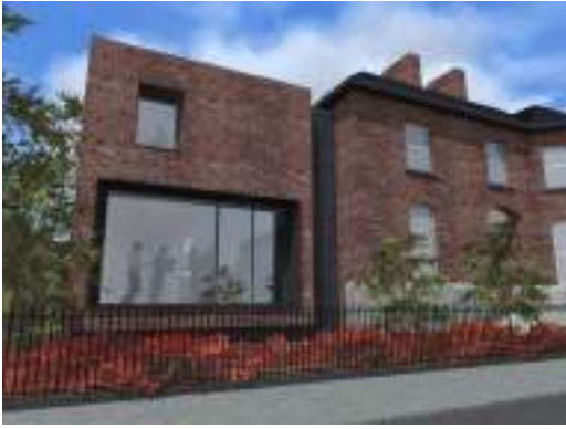
Proposed two storey building on the left