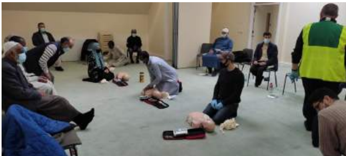
IFI staff First Aid Training

On the 3 rd of November 2021 the IFI staff attended a one-day first aid training course. The IFI staff have received basic health and safety training in all the mandatory fields and are fully compliant with HSA guidelines until 2024.