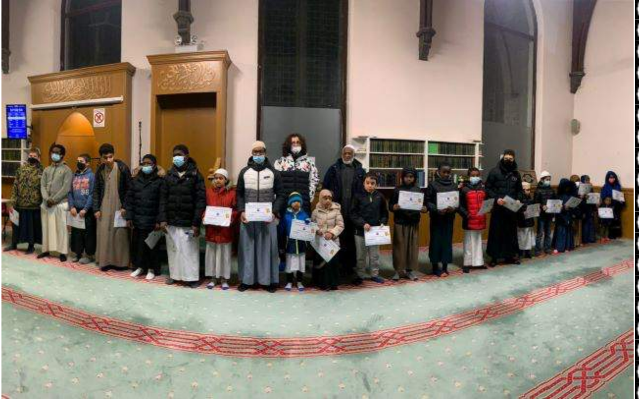
Fajr Knights Challenge for Children & Youth 23/12/ 21- 5/1/22. Ceremony at Dublin Mosque