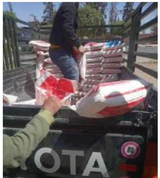
Zakat al-Fitr money received by IFI used to buy food and distribute it to the poor in some Muslim countries