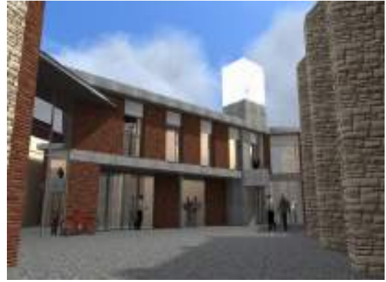
Proposed top floor building

Efforts continued to fundraise for the project. Collections after Friday prayers were made on monthly basis. Direct debt forms were distributed to those who preferred to make monthly donations. Currently there are fifteen (15) brothers and sisters who make monthly contributions to the extension project. The monthly paid monies range between €5 to €100 with an average total of €993.00 per month.