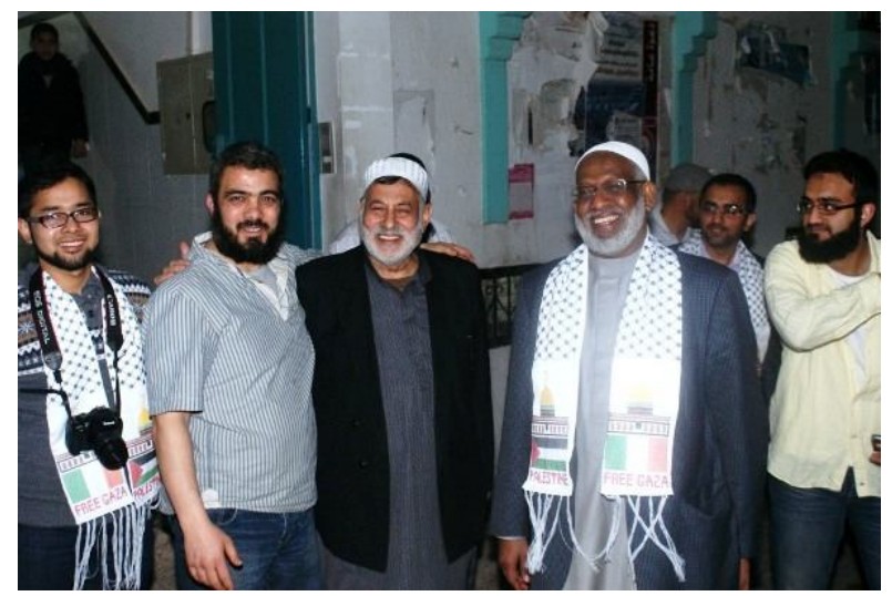
With the Chairman of Al-Aqsa Charitable Society (in the middke.)