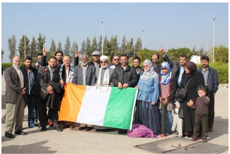
After crossing the border

We were certainly very happy to cross the border to Gaza. Members of the group took this photo immediately after crossing the border waving the victory sign.