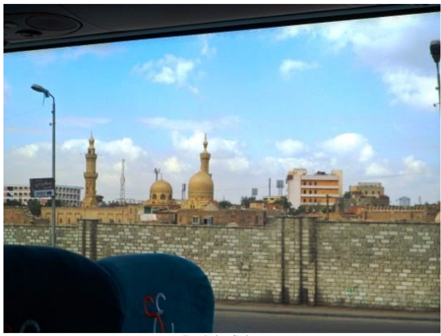
Back in Cairo