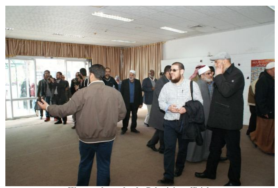
Warm welcome by the Palestinian officials