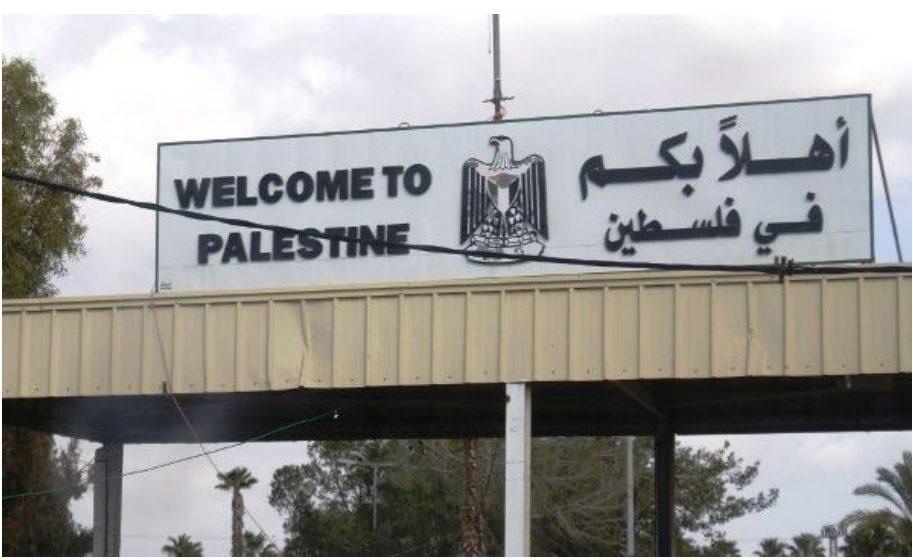
The welcoming sign of 'Ahlan in Palestine' at Palestinian Rafah