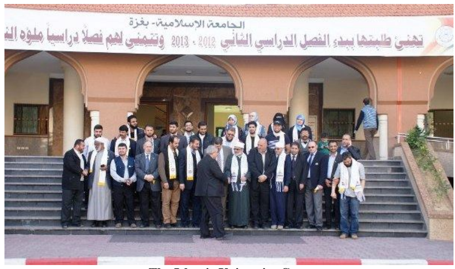
The Islamic University Gaza