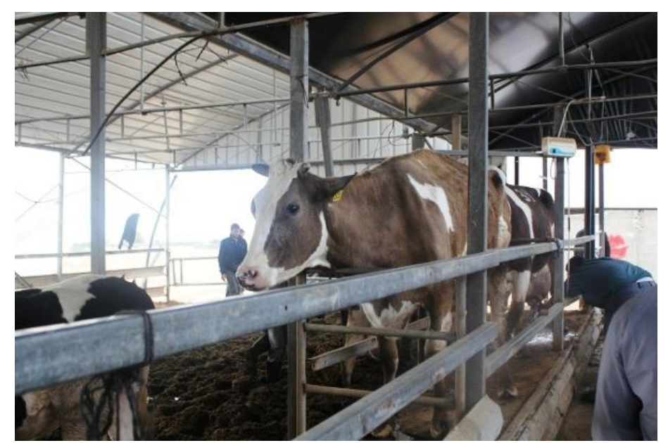
HAI Animal Production Project