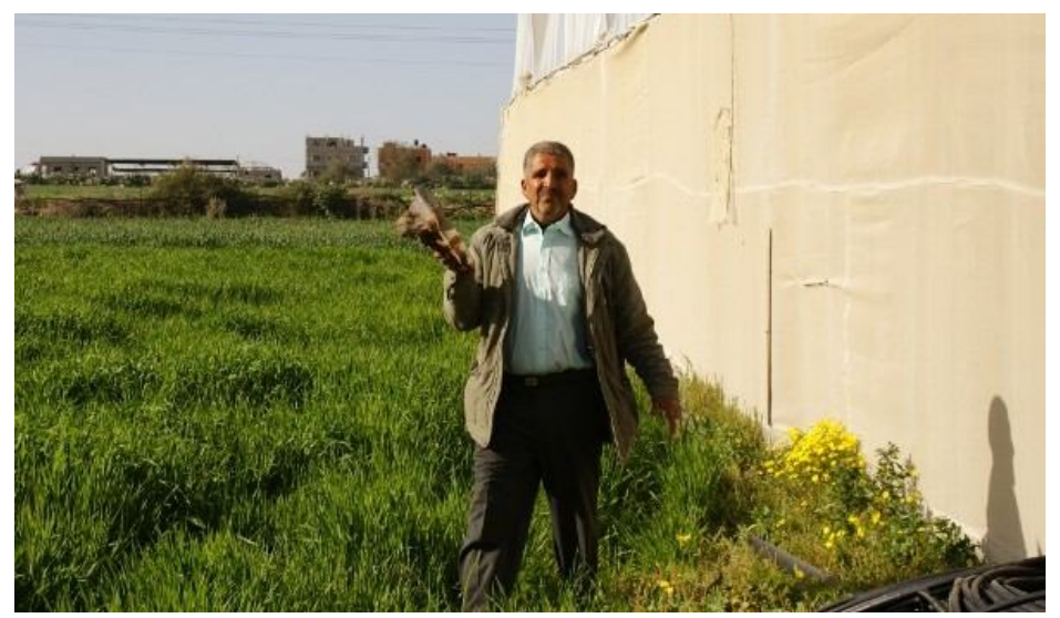
This Palestinian farmer showed us part of an Israeli rocket which fell in his farm during the last war in November 2012.