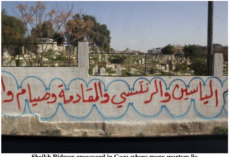
Sheikh Ridwan graveyard in Gaza where many martyrs lie