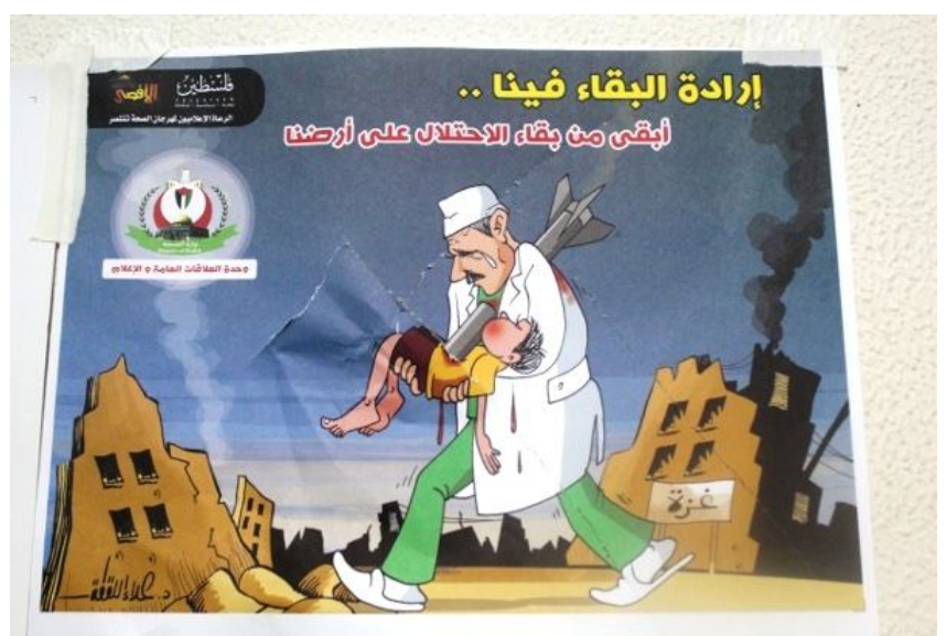
The will to exist within us is more lasting than the existence of the occupation in our land – a poster in the Al-Aqsa Charitable Clinic,