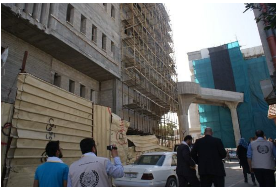
New construction work - Al-Shifa Hospital