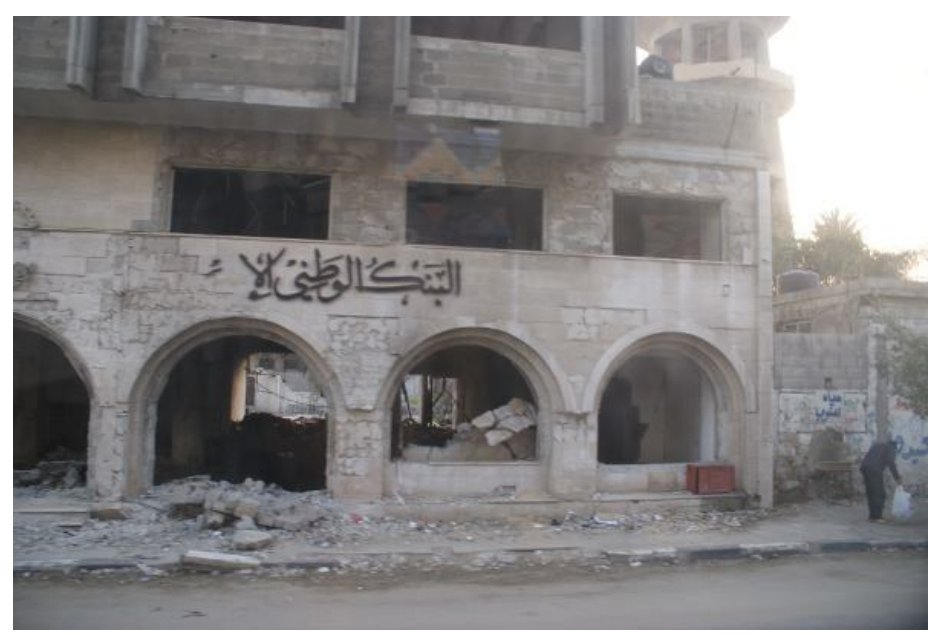
The National Islamic Bank!