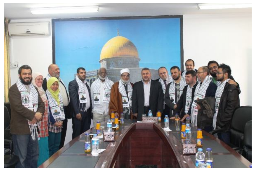
With the Minister for Awqaf and Islamic Affairs

When we used to say to the Gazans that we were very happy to be in Gaza, they respond by saying: "Insha' next time we all be in Al-Quds."