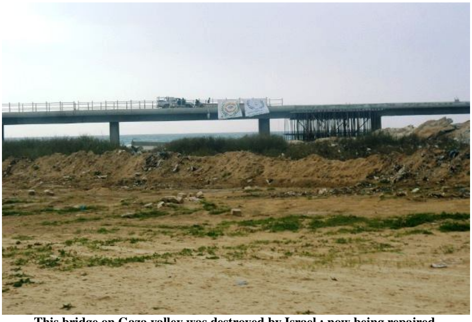
This bridge on Gaza valley was destroyed by Israel.; now being repaired.