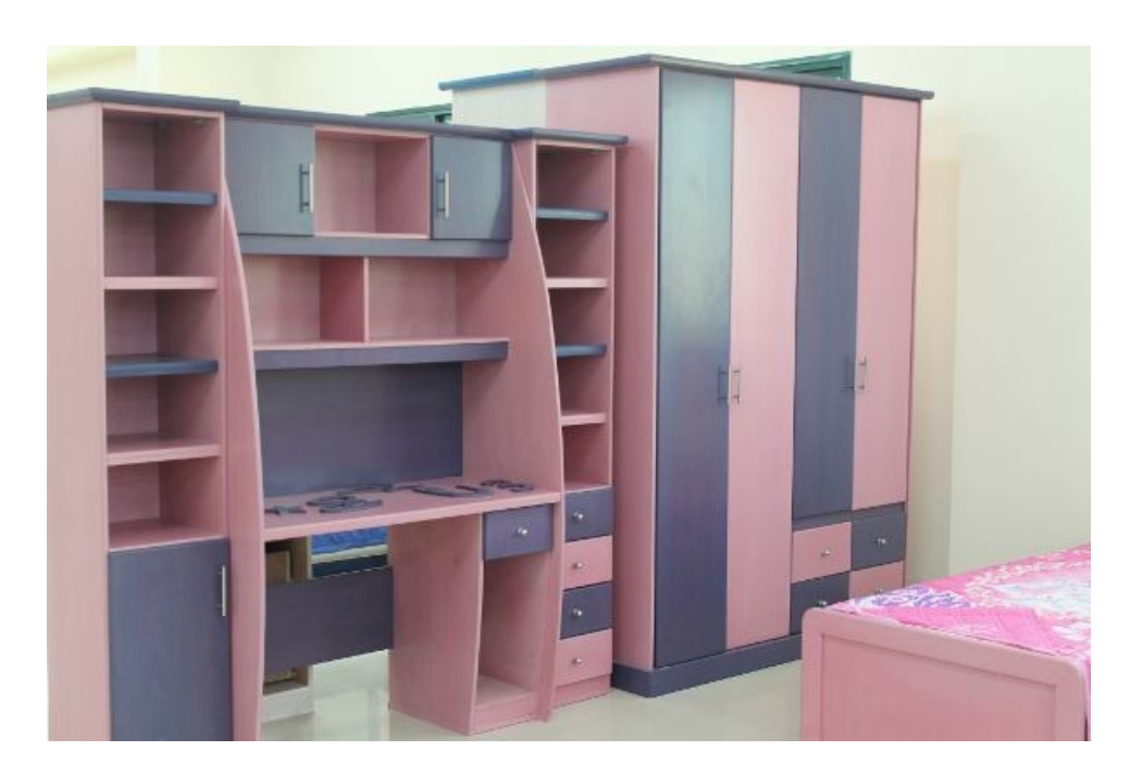
Furniture by Irada students