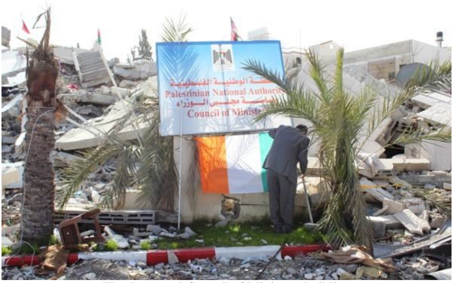
The destroyed Council of Ministers building

During the last Israeli war on Gaza much of the infrastructures in Gaza were destroyed by the Israeli air strikes.