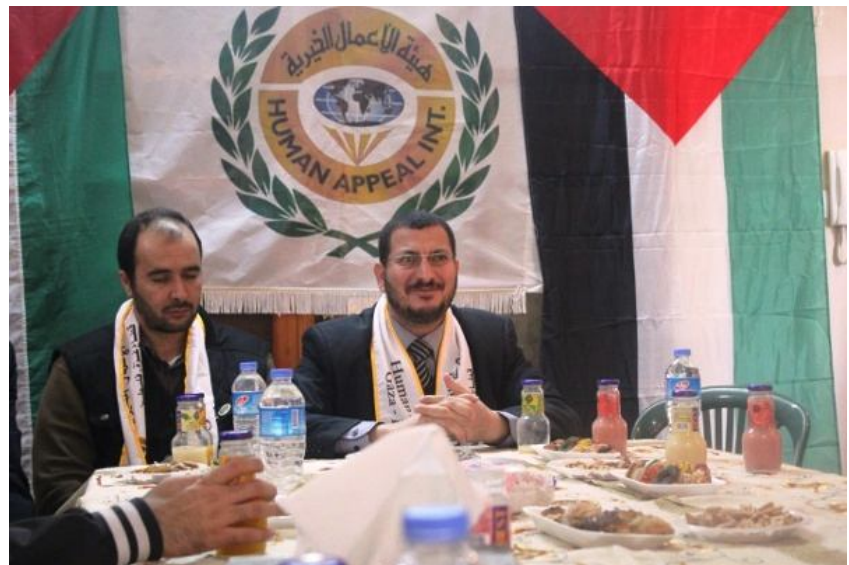
In the Office of Human Appeal International with its Director in Gaza

Human Appeal International, which has an office in Ireland, is doing very good work in Gaza. This includes renovation of hospitals and schools, provision of medical supplies to hospital, agricultural and animal production projects, water desalination projects, orphans sponsorship and even rebuilding of bridges and schools destroyed by the Israelis.