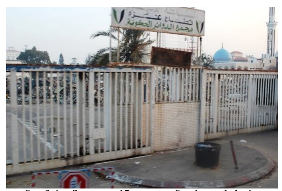
Gaza Strip – Governmental Departments Complex- reads the sign