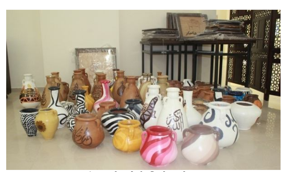
Arts and crafts by Irada students