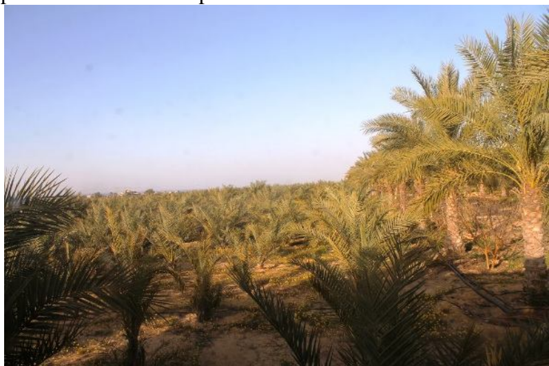
Date palm trees plantation project in Gaza

After the occupation of the Gaza Strip during the 1967 Arab-Israeli six-day war, the Israelis established 21 civilian settlements in the best agricultural land in the Strip. The protection of these settlements turned to be very costly for Israel because of the attacks by the Palestinian resistance in Gaza. By 2005 Israel dismantled all settlements in Gaza. These settlements are now called by the Gazans the liberated areas. We visited one of these areas where the Palestinian government in Gaza is planning to plant one million date palm trees.