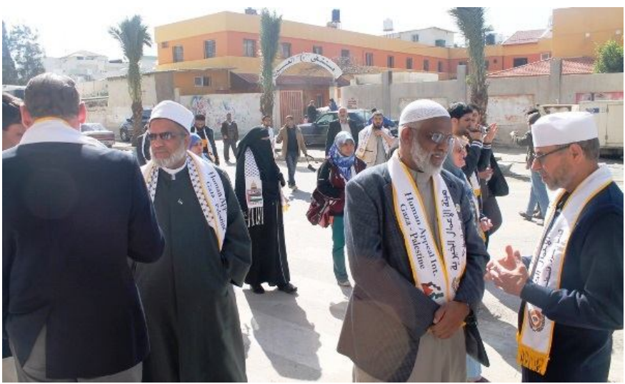
Eye hospital renovation by HAI