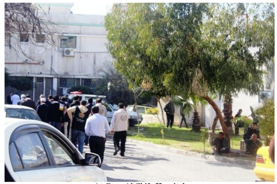
At Gaza Al-Shifa Hospital