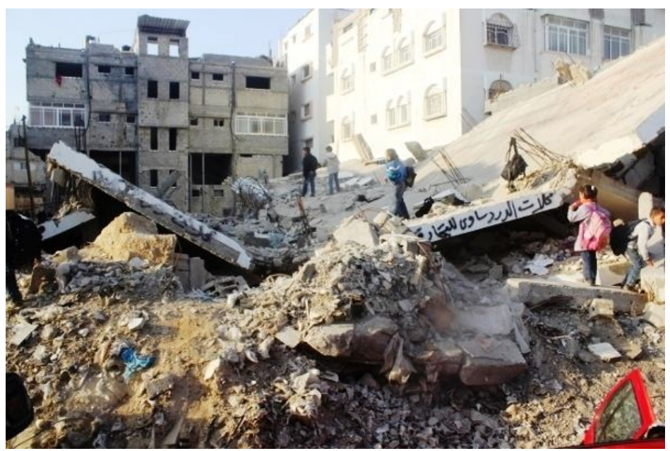
Gazan school children taking a short cut to their school through the rubble of the war-destroyed houses