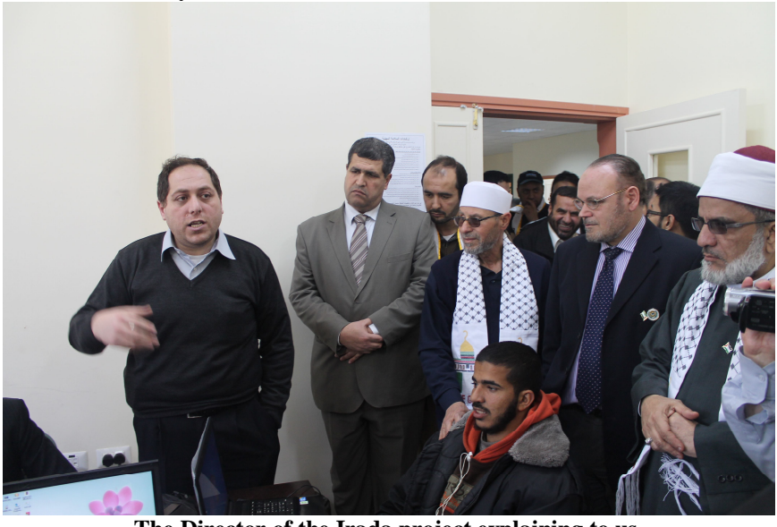
The Director of the Irada project explaining to us.

This project was established in the Islamic University - Gaza for the rehabilitation and vocational education of the war-injured and the disabled in Gaza. It is sponsored by the Turkish government. We saw many wonderful arts and crafts and furniture products manufactured by the students for the local and outside market.