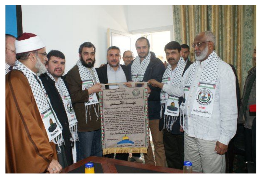
The Minister for Awqaf and Islamic Affairs presented the gift of 'the Covenant of Al-Quds' to us.