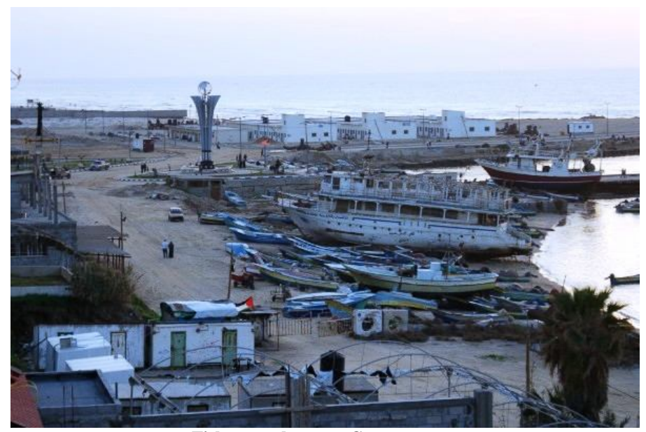
Fishermen boats at Gaza sea port