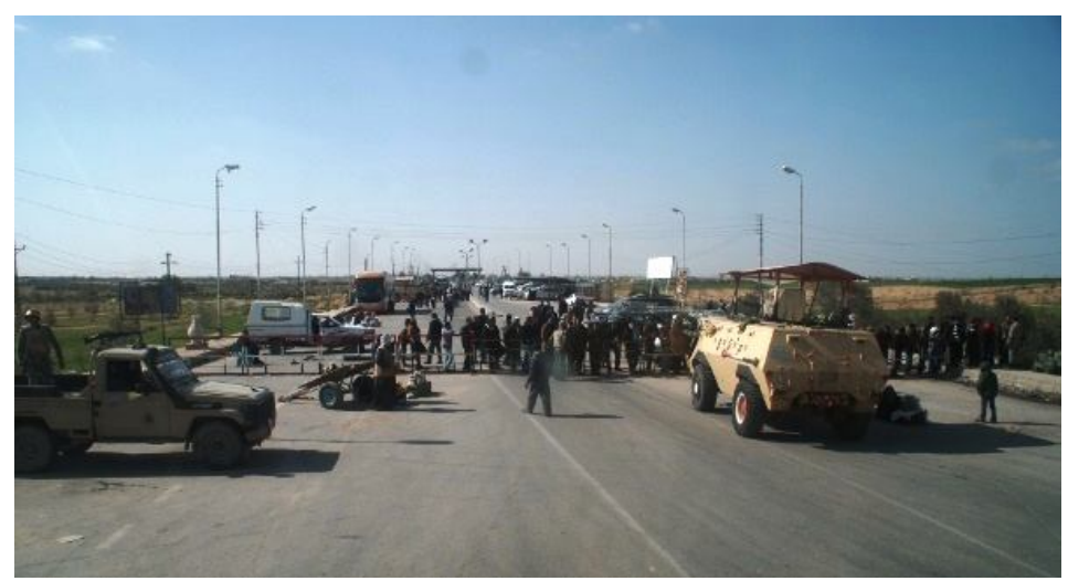
Egyptian Rafah Border