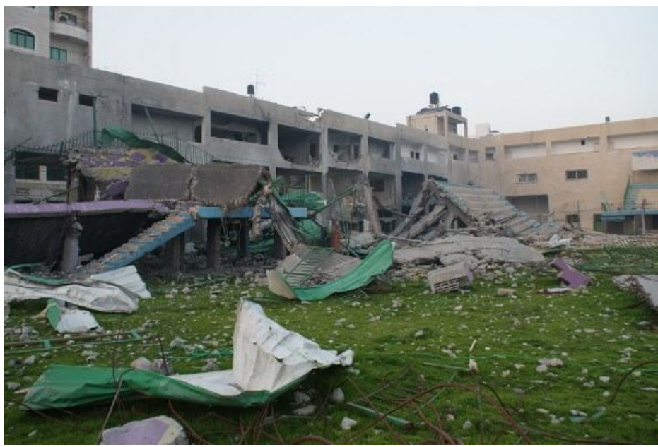
What was once 'Palestine Stadium.'