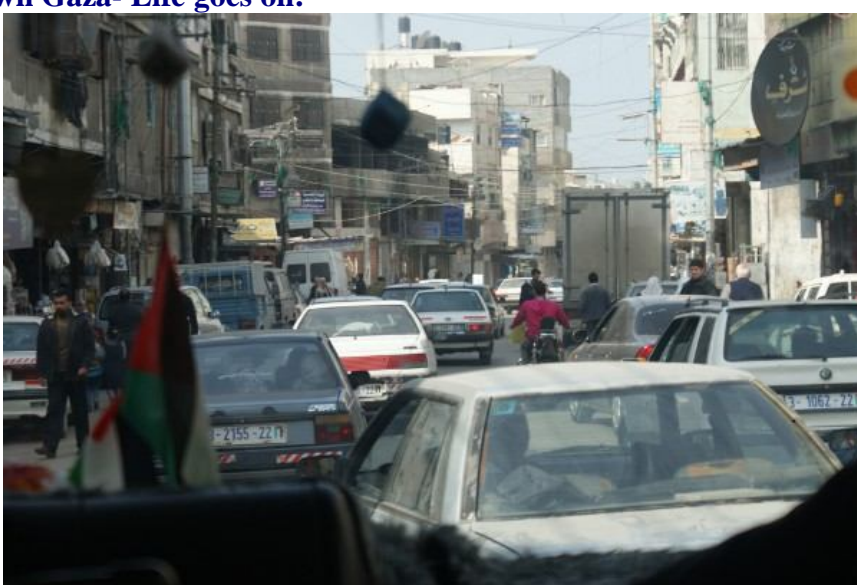
Busy street in Gaza