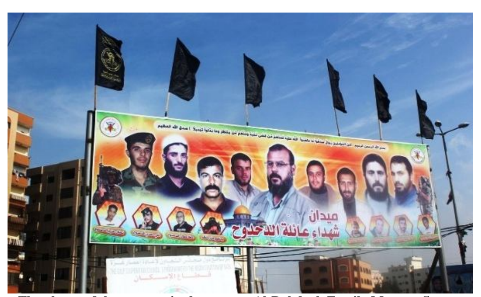
The photos of the martyrs in the streets -Al-Dahdouh Family Martyrs Square