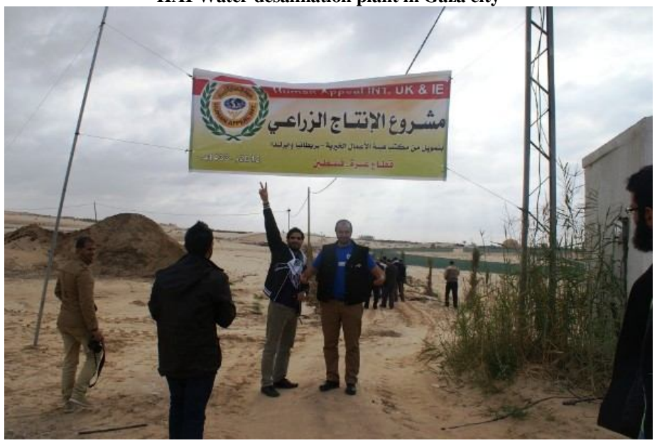
Agricultural Production Project of HAI

HAI Water desalination plant in Gaza city