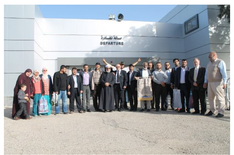
Good bye Gaza!