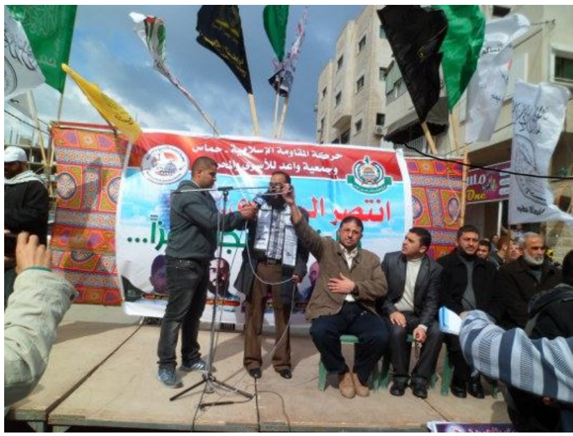
A newly freed prisoner addressing the gathering