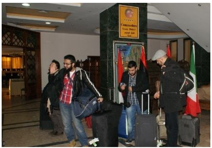
Commodore Hotel Gaza where we stayed

There are three main cities in Gaza; Khan Younis in the South, Deir al-Balah in the middle and Gaza city. The population of Gaza is 1,700,000.