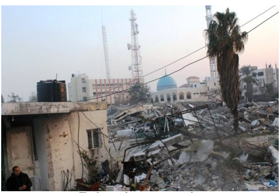
The destroyed government complex