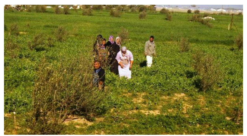
Palestinian women in their farms near the border