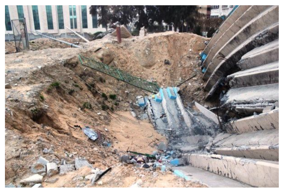
Has the missile hit its strategic target?