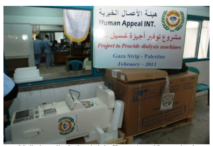
Medical supplies for hospitals by Human Appeal International