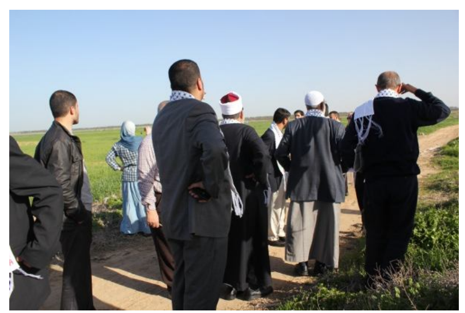
We visited these wheat and barley farms near the border with Israel cultivated by the Gazans for the first time in many years.

Before the last Israeli war against Gaza in November 2012, Palestinian in Gaza where prohibited by the Israelis from approaching the border with Israel or otherwise they risk losing their lives. A buffer zone was created which meant that Palestinian farmers were unable to cultivate their land which is adjacent to the border. Part of the deal which paved the way for the ceasefire between the Gaza government and Israel in November 2012 was that the farmers were to be allowed to cultivate their land without hindrance by Israel.