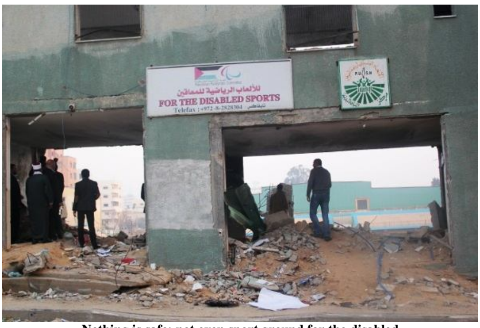
Nothing is safe; not even sport ground for the disabled