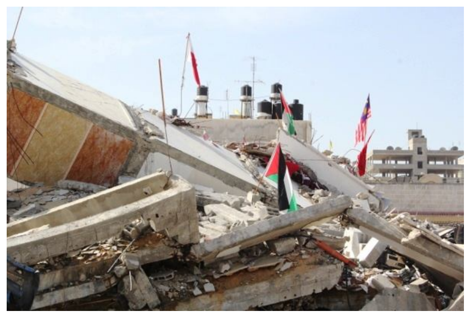
Flags of Malaysia, Bahrain and other delegations which visited Gaza on the destroyed Council of Ministers building.