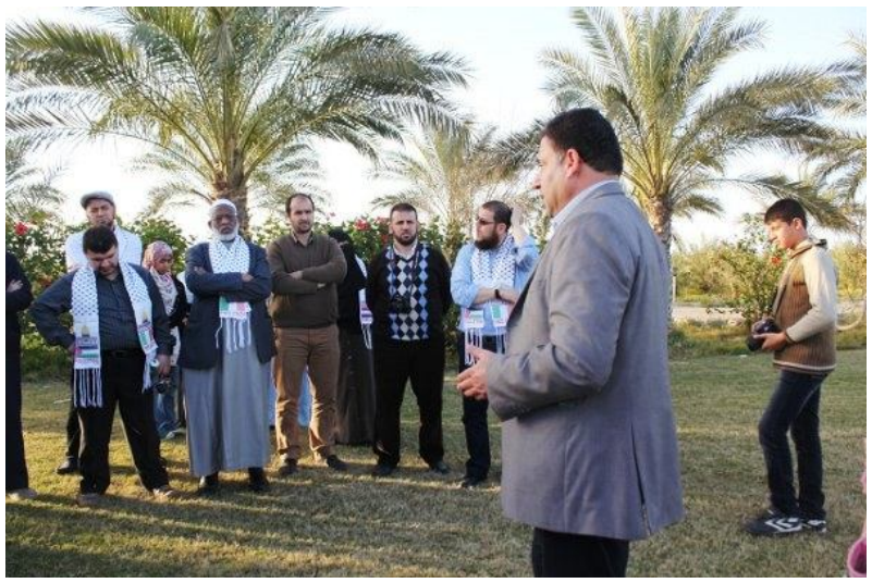
Official of the Department of Agriculture in Gaza explaining the date palm project