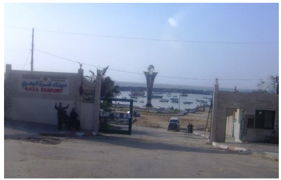
Gaza Sea Port. In the middle monument erected by the Turkish government for the Turkish martyrs of the Marmara boat