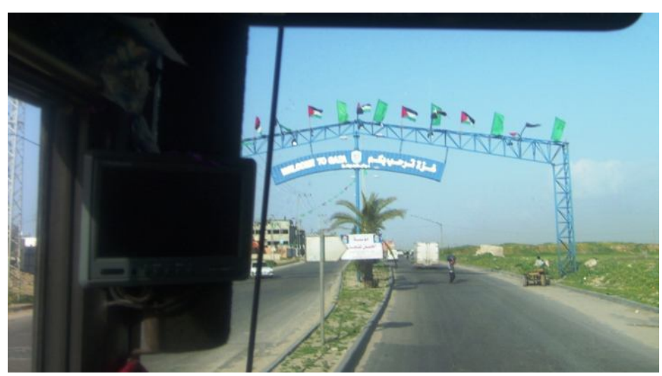
Gaza welcomes you