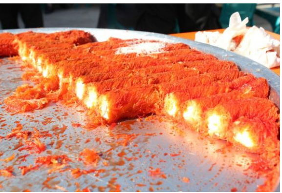
We liked the hait that no food is wasted. If any left, they will collect it and give to those who need it.