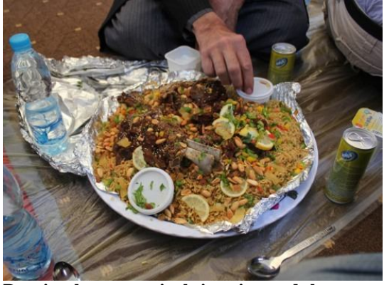
Despite the economical situation and the siege, Palestinians are very generous. They look very well after their guests.