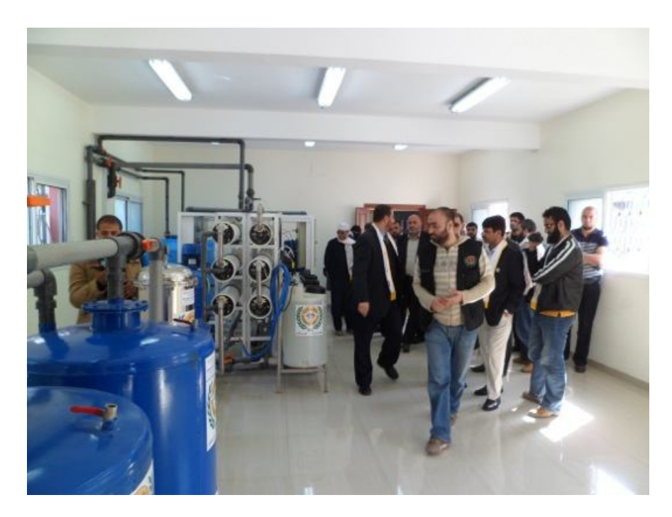
Human Appeal Water Desalination Plant