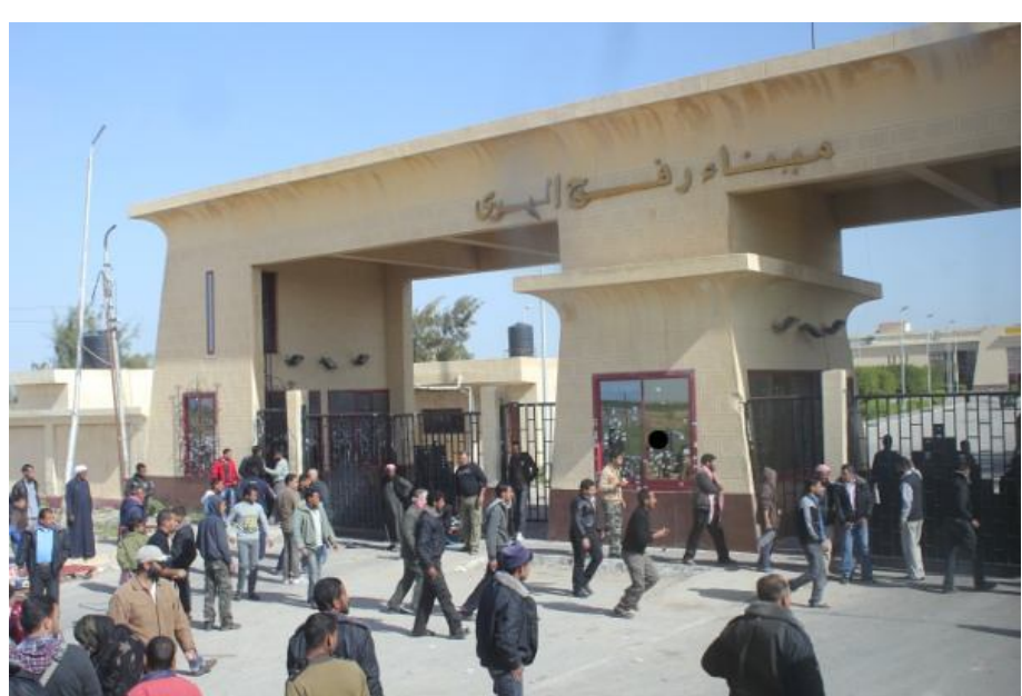
Rafah Land Port

Due to the Israeli land, sea and air siege of Gaza, the Rafah border crossing is the only link between the Gaza Strip and the outside world.