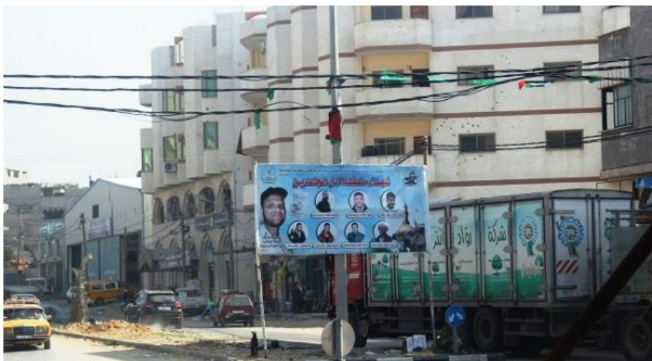
Martyrs of Tal (Hill) Al-Mujahideen Area