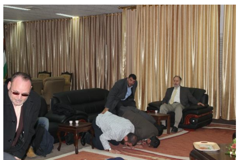
So grateful for arrival in Palestine that they fell down in prostration to Allah!