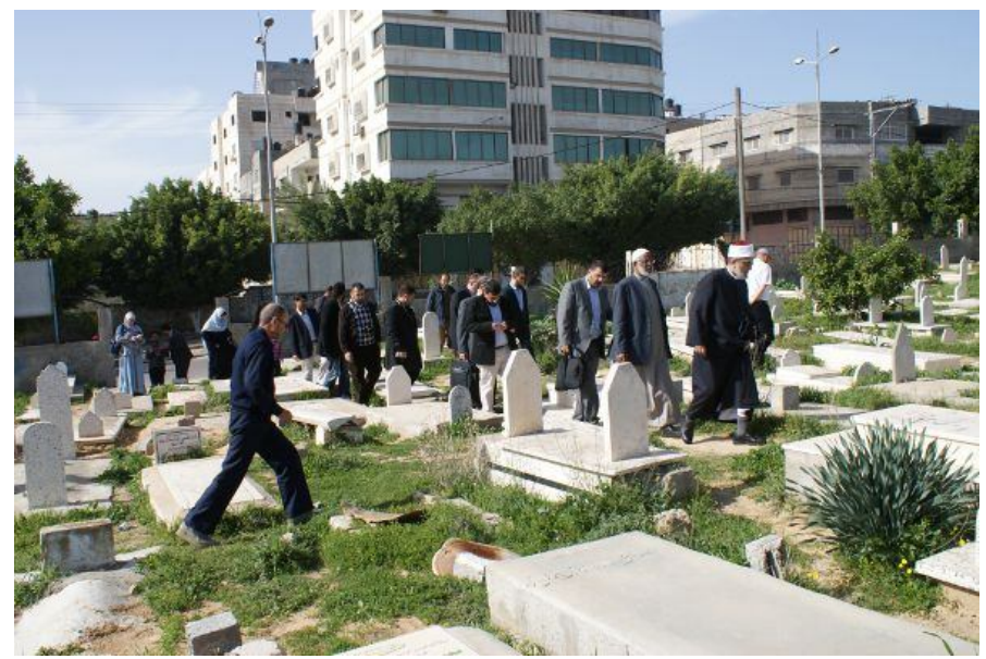
A different feeling comes to you when you enter Sheikh Ridwan graveyard and walk among the graves. It is as if you are not walking among the dead