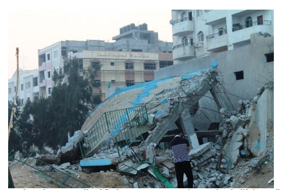
You wonder; why sport stadium? Perhaps to cause more misery and make life impossible.