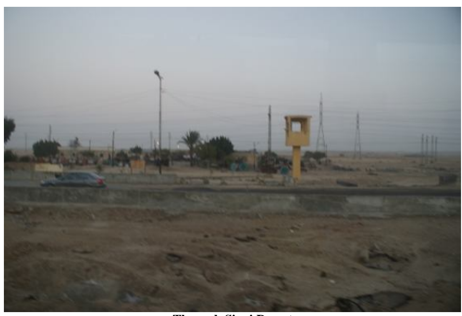
Through Sinai Desert

Sinai is a triangular peninsula situated between the Mediterranean Sea to the north, and the Red Sea to the south, and is the only part of Egyptian territory located in Asia serving as a land bridge between Asia and Africa.