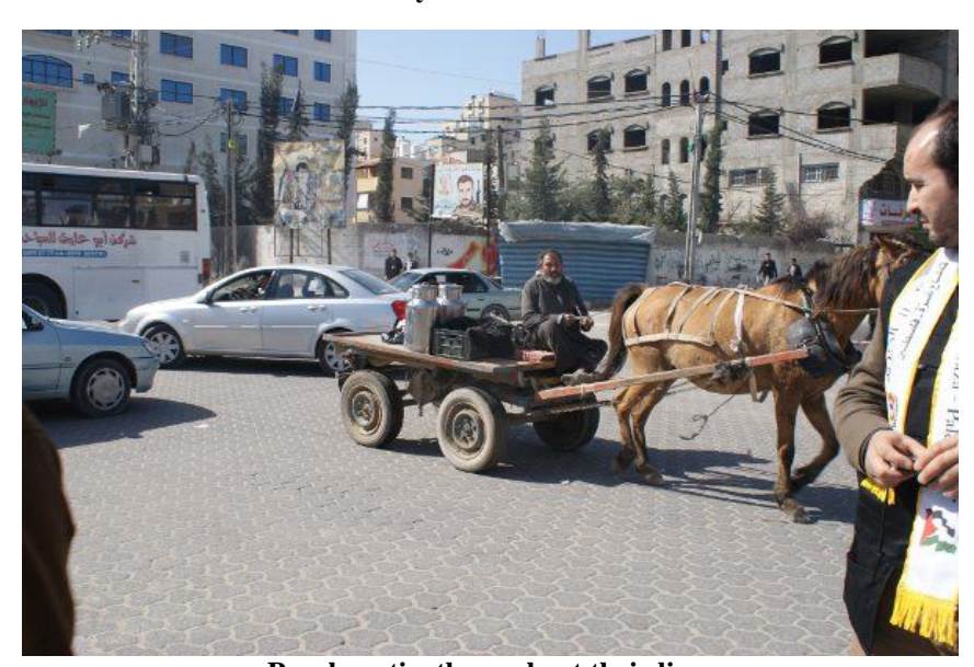
People patiently go about their lives