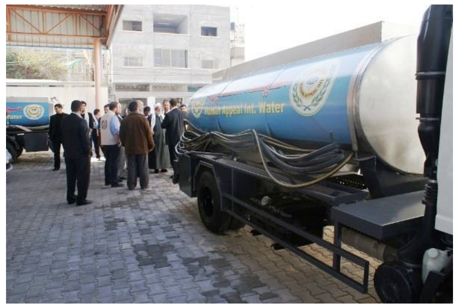
Fresh (desalinated) water distribution for schools in Gaza by HAI