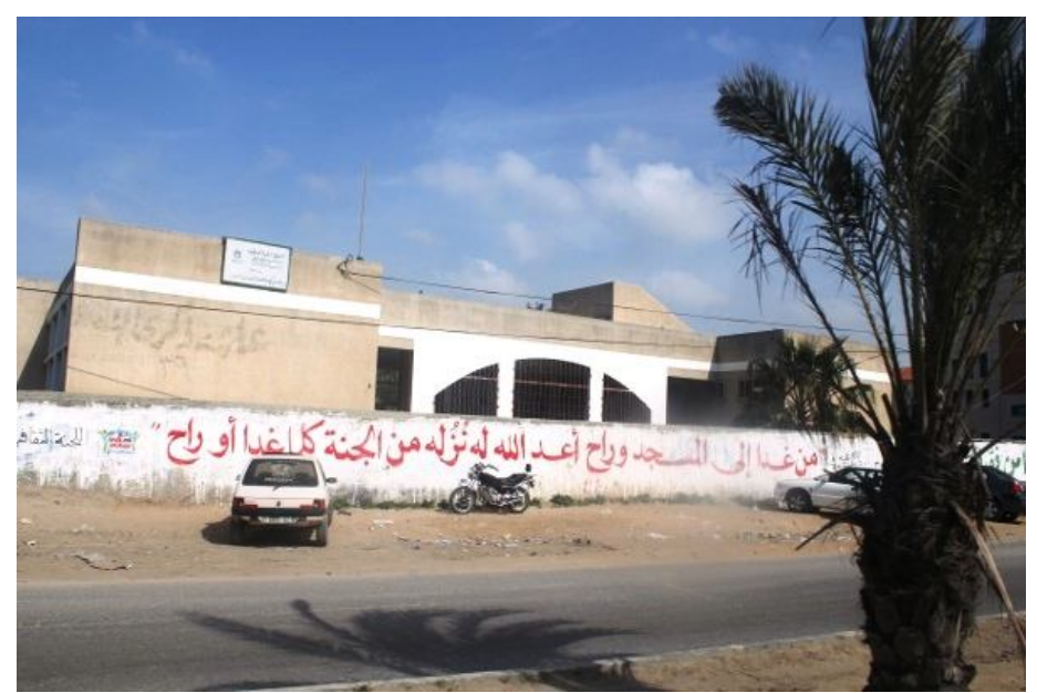
Islamic slogans in Gaza streets are very common. The spirit is different than in any other city!