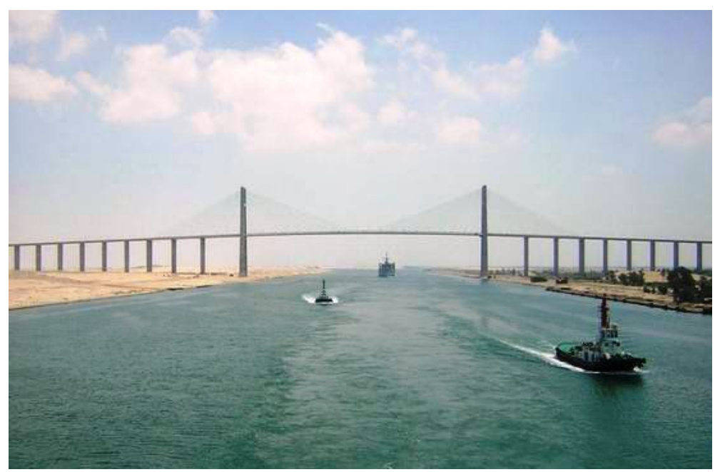
As-Salam Bridge over the Suez Canal between Asia and Africa.

The journey from Cairo to the Egyptian Rafah over the Suez Canal and across the Sinai desert took us around 6 hours.