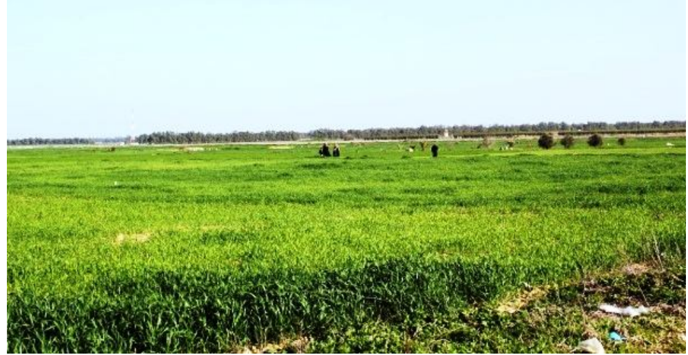
We approached the border until we could see the Israeli military vehicles on patrol behind the Israeli observation posts.